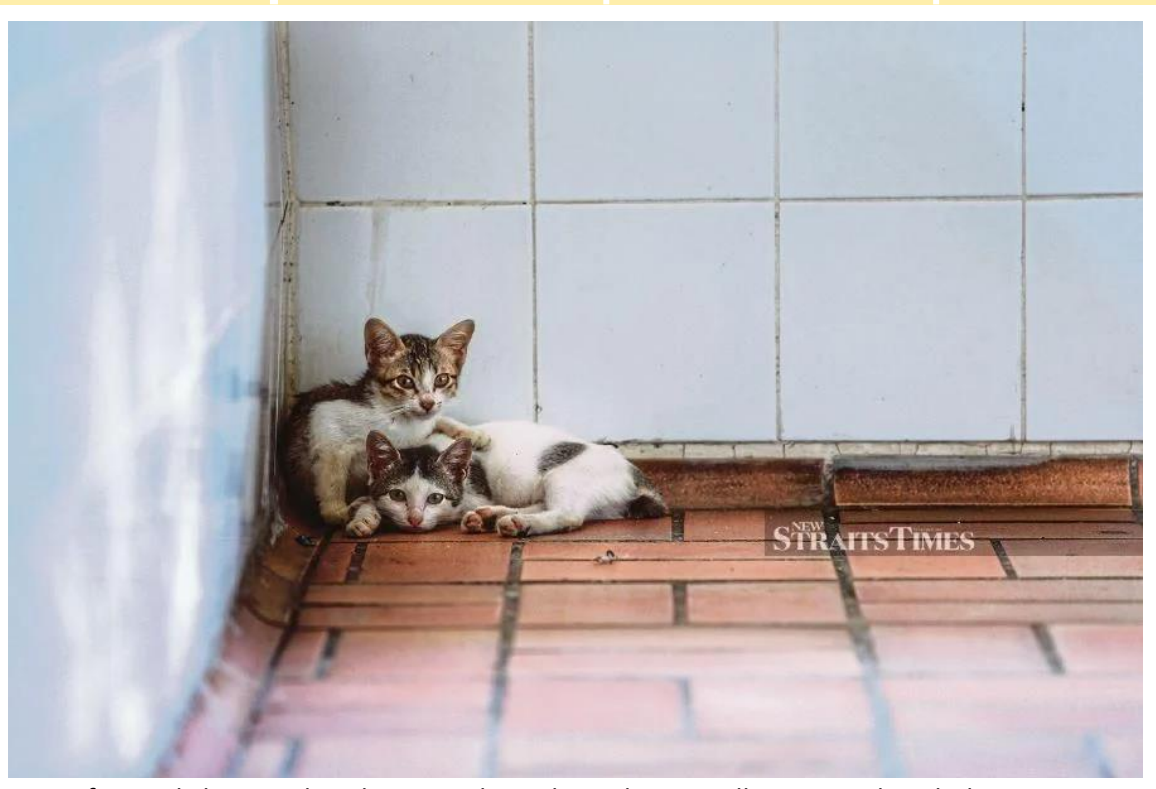
Reports of animal abuse and neglect in Malaysia have dramatically increased, with the Department of Veterinary Services (DVS) receiving 7,613 reports from 2021 to now.

KUALA LUMPUR: Reports of animal abuse and neglect in Malaysia have dramatically increased, with the Department of Veterinary Services (DVS) receiving 7,613 reports from 2021 to now.